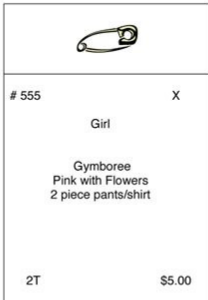
Example of Hand-written Tag:

Half-Price Code: The half-price sale runs all day Saturday (9:00 a.m. to 1:00 p.m.). An “X” in the top right-hand corner indicates that the item will be sold at full-price on Saturday. No “X” in the top right-hand corner indicates that the item will be sold at half-price on Saturday. Most Saturday shoppers are only looking for half price items.