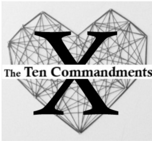
Table Group Time: