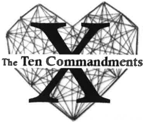
Table Group Time: