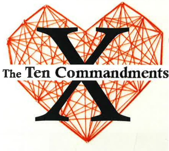
Table Group Time: